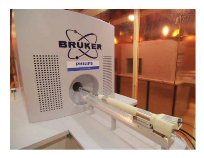
Figure 2: Picture of the first commercial MPI scanner that was installed in 2014 at the UKE in Hamburg, Germany.

Until 2014, the MPI scanners developed at various research groups around the world were experimental and the primary research focus was to increase the imaging performance (speed, sensitivity, and spatial resolution) by improving the instrumentation. While during this time first important in-vivo experiments have been carried out, the developed devices were not optimized to perform regular preclinical measurements. This changed in 2014 were the first commercial MPI scanner was installed at the University Medical Center Hamburg-Eppendorf (UKE, Germany). A picture of the scanner is shown in Fig. 2. The second MPI scanner was installed at the Charité in Berlin (Germany) and additional installations are planned at Lübeck (Germany) and Aachen (Germany). The availability of preclinical imaging devices is an opportunity for the research community to explore the full potential of MPI regarding medical applications.